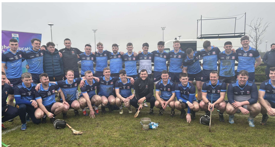
Garda College Ryan Cup winners

The Garda College got their defence of the Ryan Cup off to the perfect start, by defeating Queens University, in the second round they were narrowly defeated by SETU Carlow, who had just dropped down from Fitzgibbon Cup. Finishing second in the group set up a quarter final verses Trinity College. Garda College ran out comprehensive winners on the day and were heading to the Connaught Centre of Excellence for semi-final and finals weekend. In the tightest of matches all year, Garda College defeated UUJ by a single point to set up a repeat of the 2024 final against TU Dublin. The final was nip and tuck affair all the way, however in the last 15 minutes, the Garda College pulled away to earn a well-deserved victory and claim back to back Ryan Cups for the first time in their history.